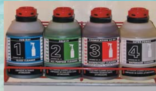
● Spray Products