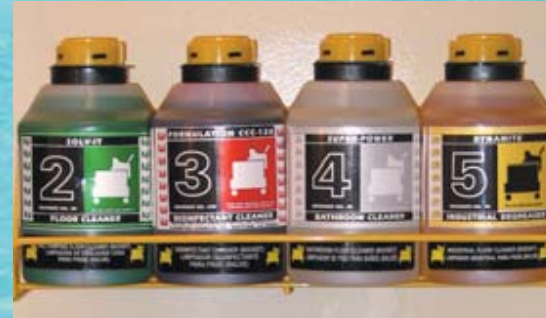
● Bucket Products